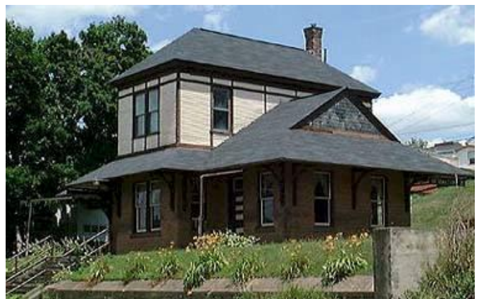
Millersburg Train Station

The next phase of the Millersburg section of the LVRT is a crossing of Rt. 147 along Wiconisco Creek. We are in contact with PennDOT to request approval to install an at-grade crossing across Rt. 147 in order to connect the trail to the proposed parking area along the east side of Rt. 147 between Pine St. and the Wiconisco Creek. There may be a possibility to use this parking facility for the trail as well as an officially designated park and ride lot for area commuters. This dual use would be a win-win for local residents and trail user alike and would open additional sources of funding to further the goals of the LVRT. ❖